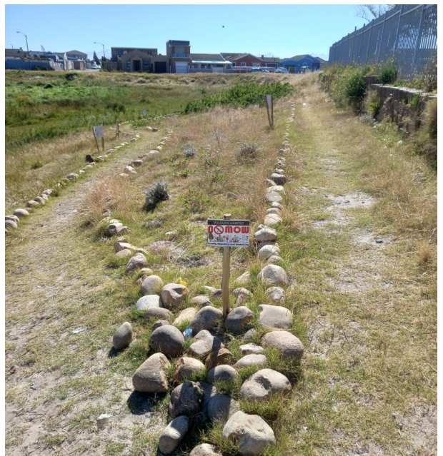
Above: 'Cues to Care' with stone-lined paths defining planted areas. Worn paths indicate current use.