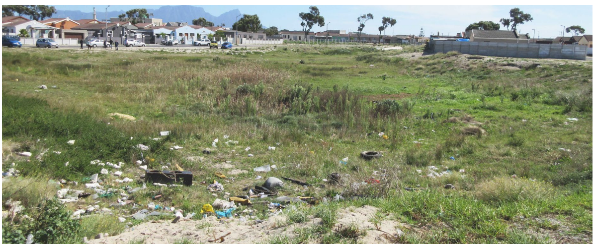
Above: April 2019, Stormwater Pond Study Site at Fulham Rd, Mitchells Plain

Work done by the PaWS research team suggests that simple, strategic interventions at a stormwater pond study site in Fulham Rd, Mitchells Plain, can contribute to curating these ponds into biodiverse ‘living libraries’.