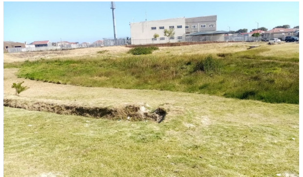
Above: Thick kikuyu at the pond before (top) and after. Strategic mowing is beneficial in providing 'cues to care' however the grass soon grows back. More frequent and strategic mowing interventions may be required that speak to the different needs of each pond.