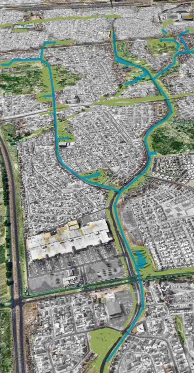
Above: Imagining stormwater ponds as biodiverse stepping stones for wildlife in the urban landscape

Individually, stormwater ponds could be re-imagined as 'living libraries' but to function more effectively, these ponds need to be considered collectively, as stepping stones in the urban landscape to improve the city's biodiversity strategy targets.