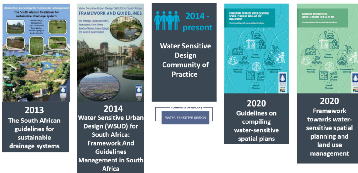
Figure 2. Milestones in the evolution of WSD in South Africa through the publication of guidelines and the establishment of the WSD CoP programme.

The initial phase of the WSD CoP programme (2014 to 2018) included purposeful engagement with a wide group of stakeholders and promoted knowledge integration in the field of WSD through, inter alia , an expanded training programme with a combined reach of over 1,000 water stakeholders in both the public and private sphere in South Africa (Carden, 2019). It was able to indicate that this approach has the potential to generate new understandings about innovative practices and reflexive learning within WSD in South Africa, and to develop knowledge connected to policy development and change to influence planning and design towards WSCs. The main focus areas of the first phase of the WSD CoP programme were: